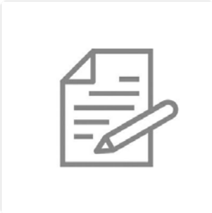
Lightweight Wall Cladding Profile Cladding Colour Other