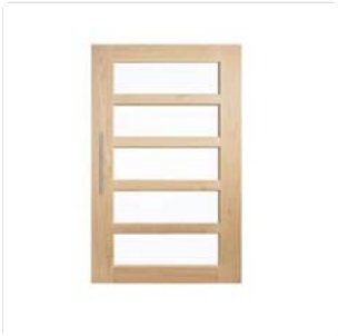
Front Door Profile Corinthian Doors - Blonde Oak - AWOWS 5G - 2340mm x 1200mm - with Translucent Glazing Entry