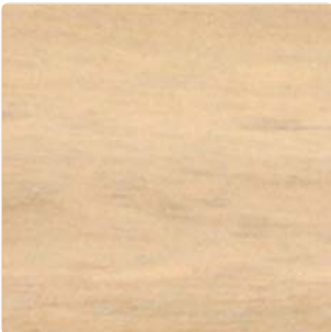
Front Door Colour Johnstone's - Clear Stain Entry