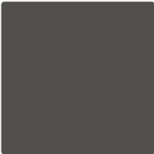
PVC Downpipes Taubmans - Colorbond Monument CB 66

Builder: * To All Downpipes Backing Brick