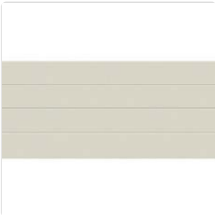
Garage Door Profile Dynamic Garage Doors - Flatline Garage

Clarendon Homes cannot guarantee that the colour you see accurately portrays the true colour of the product. Actual product colour may vary from the images shown. Every monitor or mobile display has a different capability to display colours, and every individual may see these colours differently. In addition, lighting conditions at the time the photo was taken can also affect the image's colour.