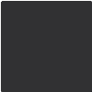
Aluminium Window and Door Frame Colour Wideline - Colorbond Monument - Matt

Builder: * To All Downpipes Backing Brick