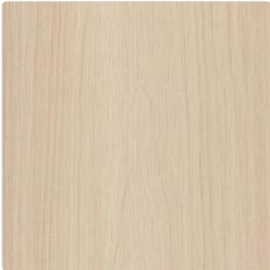
Feature Wall Cladding Profile NewTechWood - Castellation Cladding - Canadian Cedar - 25mm Ribbed - UH 61