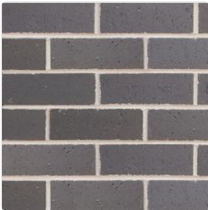
Brick Austral Bricks - Metallix - Titanium